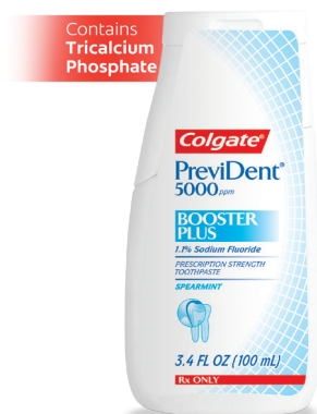
PreviDent® 5000 ppm Booster Plus (1.1% Sodium Fluoride) Toothpaste Spearmint NDC: 0126-0074-92 Fruitastic NDC: 0126-0072-92