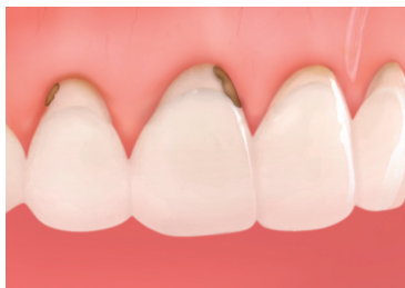
Receding gumline With exposure of root surfaces.