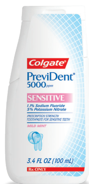
PreviDent® 5000 ppm Sensitive (1.1% Sodium Fluoride and 5% Potassium Nitrate) Toothpaste NDC: 0126-0070-61