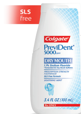
PreviDent® 5000 ppm Dry Mouth (1.1% Sodium Fluoride) Toothpaste NDC: 0126-0016-61