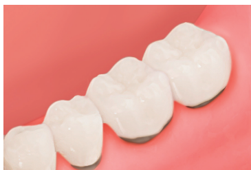
Restorations Might harbor bacteria at their margin, putting them at risk for recurrent decay.