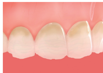
Acid erosion Might expose dentin, leading to hypersensitivity.