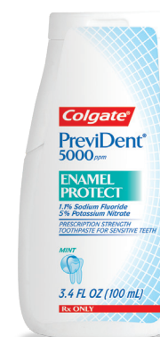
PreviDent® 5000 ppm Enamel Protect (1.1% Sodium Fluoride and 5% Potassium Nitrate) Toothpaste NDC: 0126-0022-92