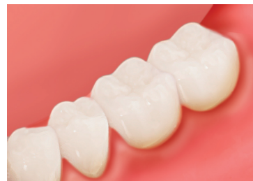
Periodontal treatment Might leave dentin exposed with an increased risk of dentin hypersensitivity and root caries.