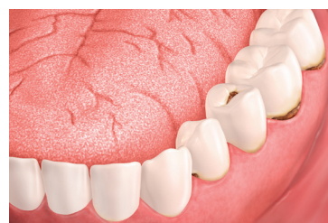
A dry mouth Can increase your risk of decay.